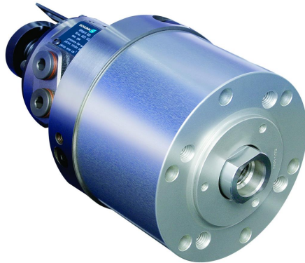
OPUS-V Closed-center Cylinder