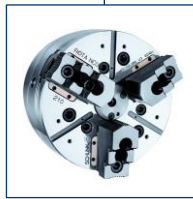
Power Lathe Chucks without Through-hole