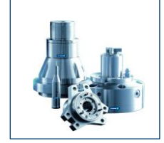
Hydraulic Expansion Technology