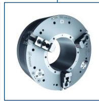
Pneumatic Power Chucks