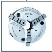
Manual Lathe Chucks