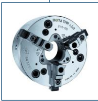
Power Lathe Chucks with Jaw Quick-change System