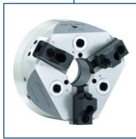
Power Lathe Chucks with Through-hole