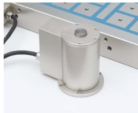
DEMAG Status: Pin is „below“.