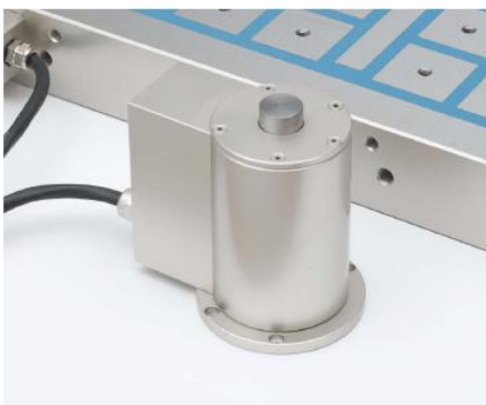
MAG Status: Pin is „above“.