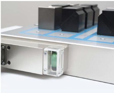
MAG Status: Status display is „green“.

The new and patented status display for SCHUNK-Magnetic chucks enables to monitoring the actual status of the magnetic chuck.